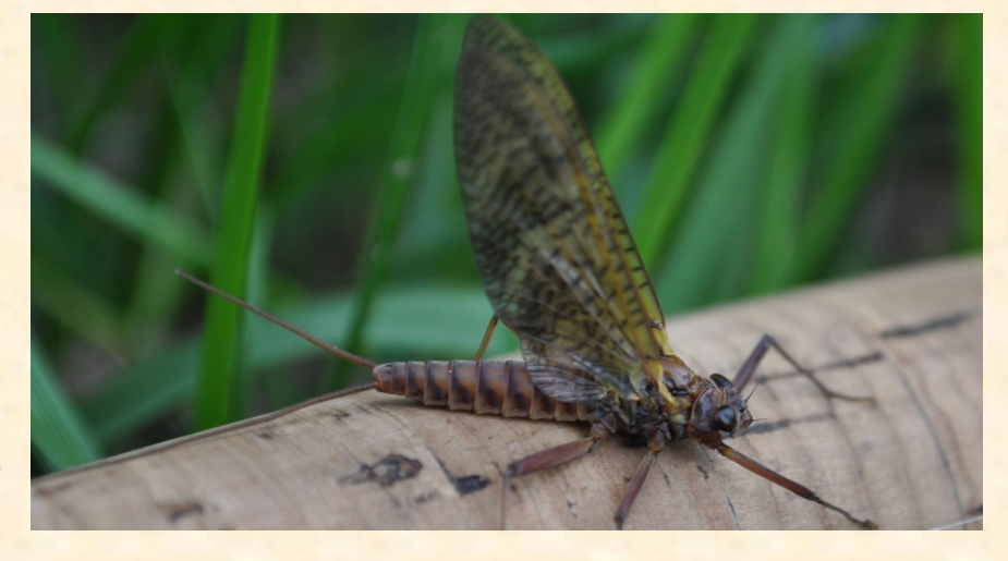
The iconic March Brown, this insect is important to anglers but is increasingly rare in the UK, information about sightings of this animal will be useful as the Annan is one of the few remaining strongholds.