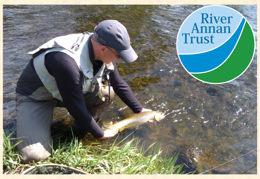
A 5lb summer brownie being returned in 2012